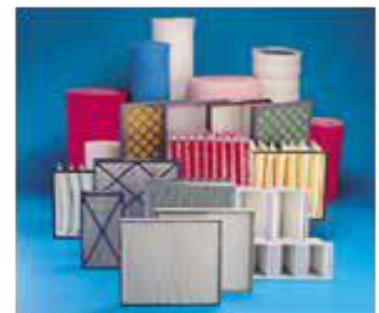
Commercial AHU Filters

Pristinz Filter can also be sold in solution form which can then be sprayed on new filters in commercial AHUs