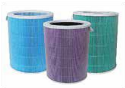
Air Purifier Filters